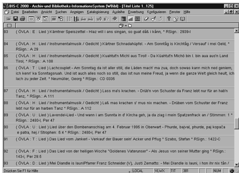
Figure 6: List of hits: Searching for a song containing the word Sonntag 'Sunday' only in the ÖVLA pool.

First the official seal of the archive is shown. The single-letter codes are: “E” = Einbändiges Druckwerk (monograph), “H” = Handschrift (manuscript), “T” = Tondokument (audio recording), “U” = Unselbständiges Werk (article), “F” = Fortlaufendes Werk (periodical), and “D” = Bandauführung (volume of a journal). The title, incipit, number of verses, and voices follow.