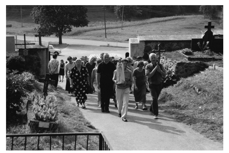
Fig. 1: Pivašiūnai. Feast of the Assumption, 15 Aug. 2001.

Ethnographic studies carried out in Pivašiūnai show that the Assumption became known as a religious feast much earlier than the declaration of the church festival octave. To establish the relationship of this church festival with folk traditions as well as with the religious and secular life of the people, in 2001 (during the Pivašiūnai church festival octave of the Assumption) a study of its contemporary state was carried out [Mardosa 2004: 101–104]. On August 15, three groups of pilgrims representing different generations were interviewed (Group 1: 20–40 years old, Group 2: 41–60 years old, Group 3: over 60). Each group contained the same number of respondents, 158 altogether. In addition, a group of young pilgrims (8 persons) from southeast Lithuania (Kazlų Rūda) was asked to fill out questionnaires. This article only discusses data related to the following two aspects of the Pivašiūnai church festival: (a) understanding and importance of the church festival, and (b) motives for participating in it.