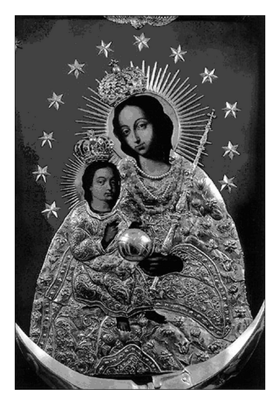
Fig. 8: Miraculous image of St. Mary in church of Pivašiūnai (17th century).

60.3%). Only 2.5% of respondents said they were planning to stay for a longer time, and the rest said nothing about their plans.